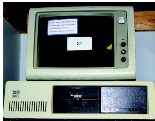
A museum piece by today's standards, one of LGC's earlier IBM personal computers, now retired.