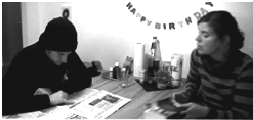
Au ja, was läuft denn?

Culturally diverse LaVergne is among the first cities to offer “Transparent Language Online,” a software program that can teach a large number of different languages at the city’s public library.