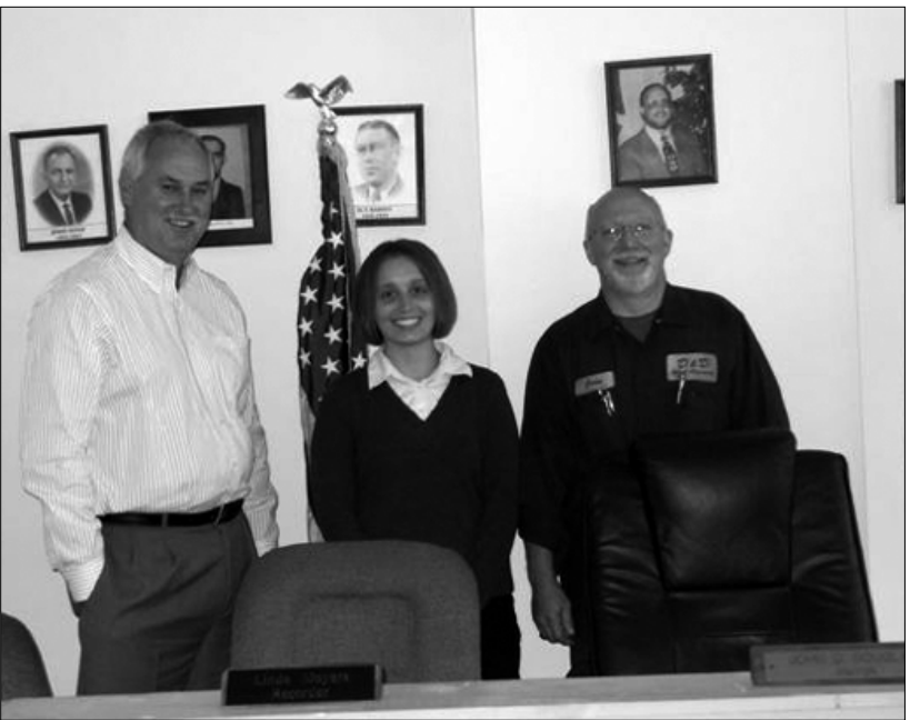
The town of Cumberland Gap closed a $5,000 Highway Safety Grant Anticipation Note.