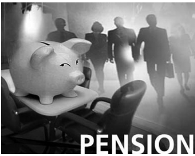
PENSION A March GAO report indicates public pension plans are viable.

critics that the Great Recession has had an impact on public pension plans, but also documented that plan sponsors are making adjustments to retirement plans that assure no less than their medium-term viability. The authors of the report wrote, “Since 2008, the combination of fiscal pressures and increasing contribution requirements has spurred many states and localities to take action to strengthen the financial condition of their plans for the long term, often packaging multiple changes together.” The report found that 35 states have reduced pension benefits, mostly for future employees due to legal provisions protecting benefits for current employees and retirees. A few states, like Colorado, have reduced postretirement benefit increases for all members and beneficiaries of their pension plans. Half the states have increased member contributions, thereby shifting a larger share of the pension costs to