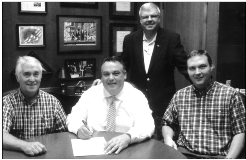
The city of Dyersburg closed a $4.5 million loan to use on various municipal projects.