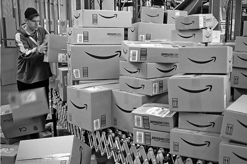
In 2008, states lost an estimated $18 billion in uncollected taxes from out-of-state sales, $7.7 billion of which were from online sales. That figure is expected to climb to $23 billion this year, with almost half of that coming from Internet transactions. The Marketplace Fairness Act would allow states to enforce tax laws currently being ignored.

When the agreement went into effect in 2005, it opened an amnesty program in which states would forgive sales taxes owed by companies if the businesses voluntarily registered to collect sales taxes. Although the agreement can’t force companies to collect sales taxes on out-of-state transactions, a company that complies with it does not have to pay the sales taxes owed to states before