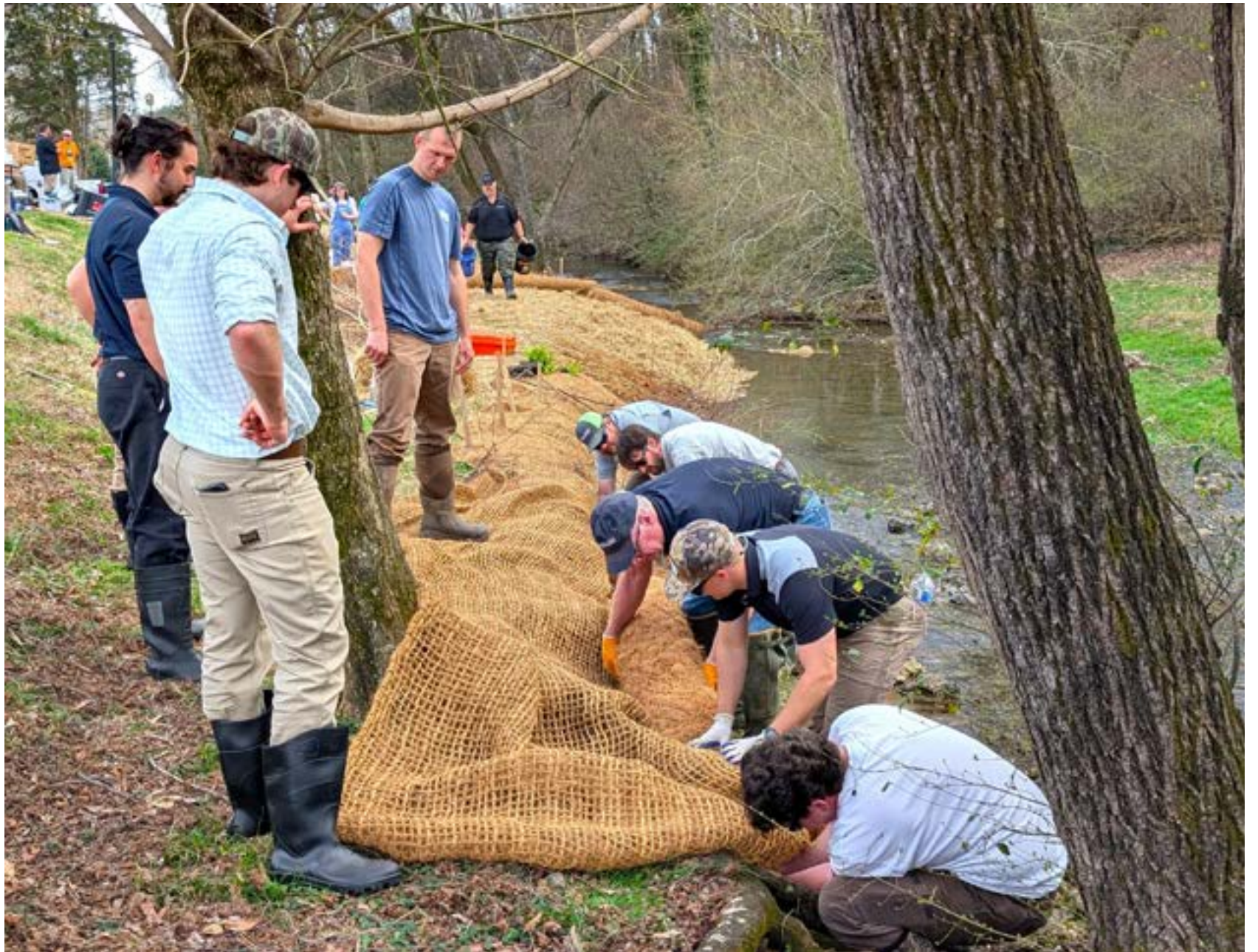
Local residents, professors and students from the University of Tennessee, and stormwater officials from Farragut, Knoxville, and Knox County spent an afternoon at Farragut’s Founders Park repairing riparian erosion on Turkey Creek. The workshop involved an educational session with presentations on how the mitigation project would work and then a hands-on component where participants got a chance to put what they had learned into action.