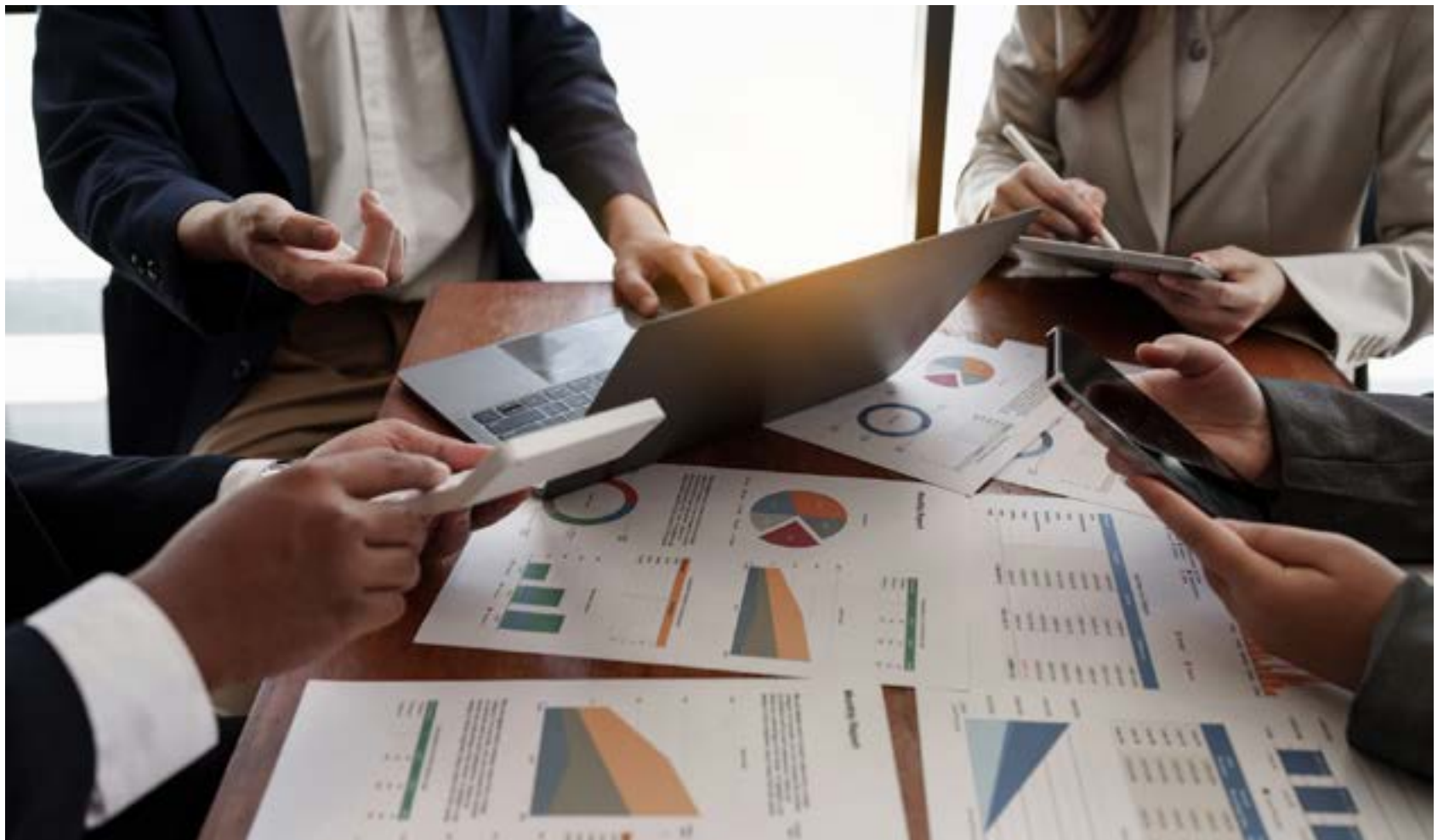
Many municipalities oversee the budgets of local education agencies (LEAs) within their community and are responsible for helping fund capital projects and costs associated with fluctuating enrollment.

In addition to LEA leadership – such as finance officers, directors of schools, and school boards – these fiscal principles can also guide local government officials who review, approve, and oversee local budgets.