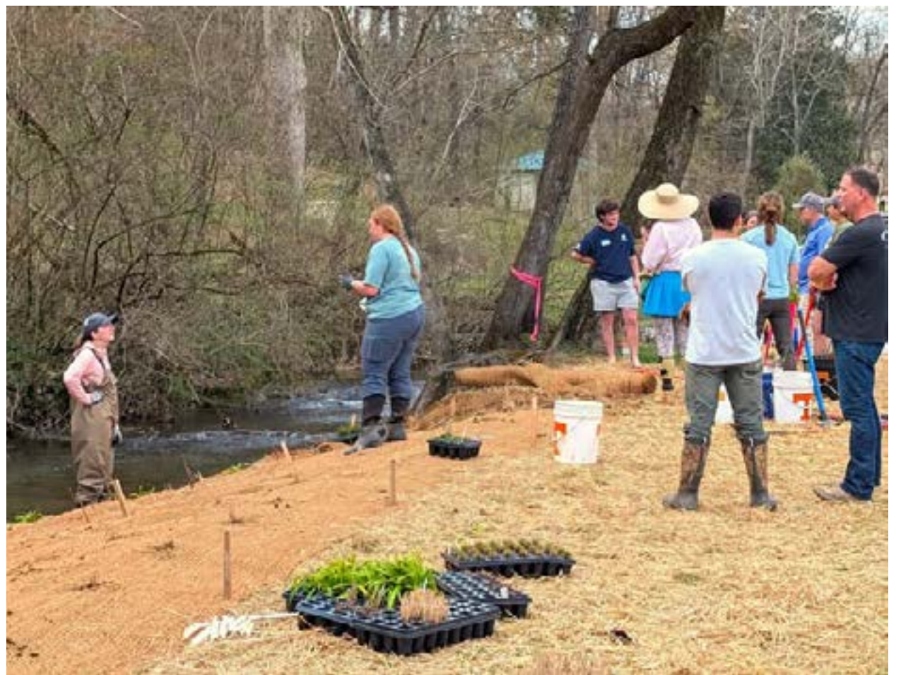
Local stormwater officials are hoping citizens who participated in the workshop will take the lessons learned back to their own neighborhoods and homes and undertake their own mitigation work. The project has also brought stormwater officials together with researchers and the private sectors to learn the latest technology for preventing sedimentation.

“The people who attend these workshops generally have interest in repairing a stream bank on their property, and they may have some understanding that sediment is bad,” he said. “We give them the knowledge to do some repairs,