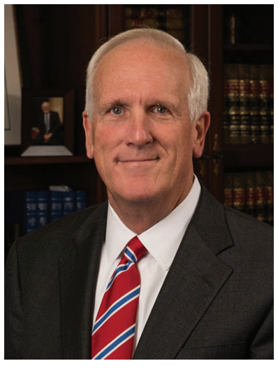
Herbert Slatery Tennessee Attorney General

Each state's share of the funding has been determined by agreement among the states using See OPIOID on Page 5