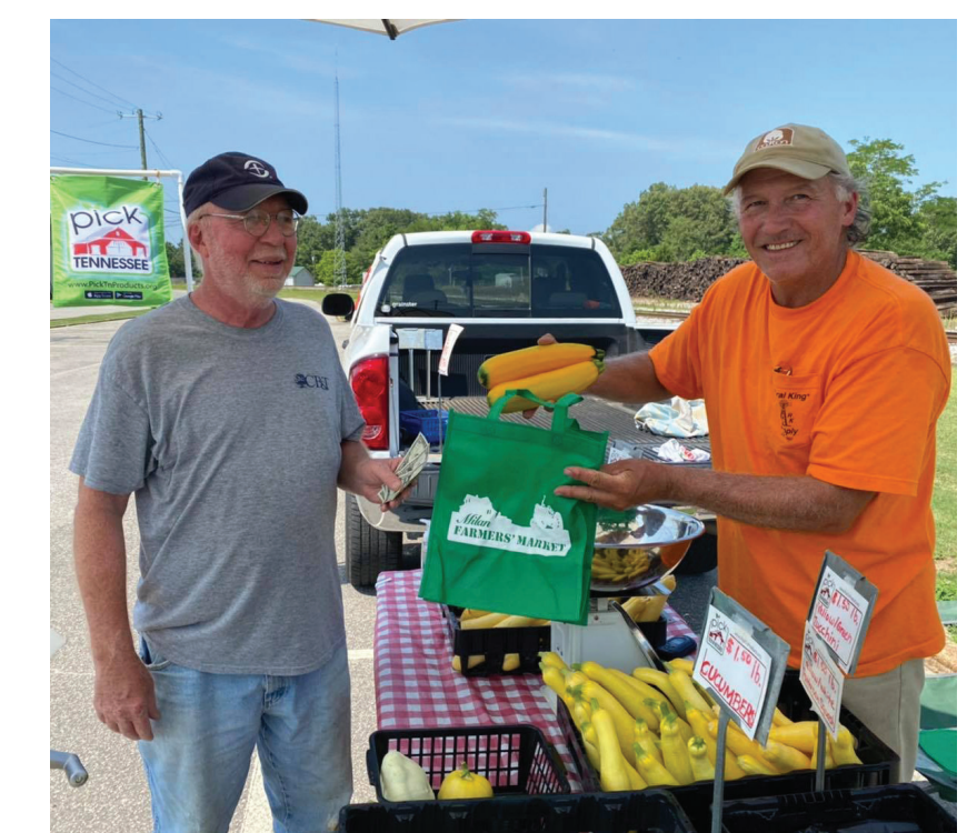
The Milan Farmers' Market will gain a new home in addition to walkability improvements to Milan's downtown as part of the latest round of Community Facilities Director Laon and Grant Program funds from USDA. The city is one of seven Tennessee municipalities that will receive funds through the program and more than 500 government entities nationwide that were awarded funds.

The town of Rutherford will receive a $247,000 loan and $100,000 grant to resurface five city streets in need of repair while Spring City will use a $320,000 loan and $55,000 grant to purchase a new pumper truck for the Spring City Volunteer Fire Department to improve protection for the public