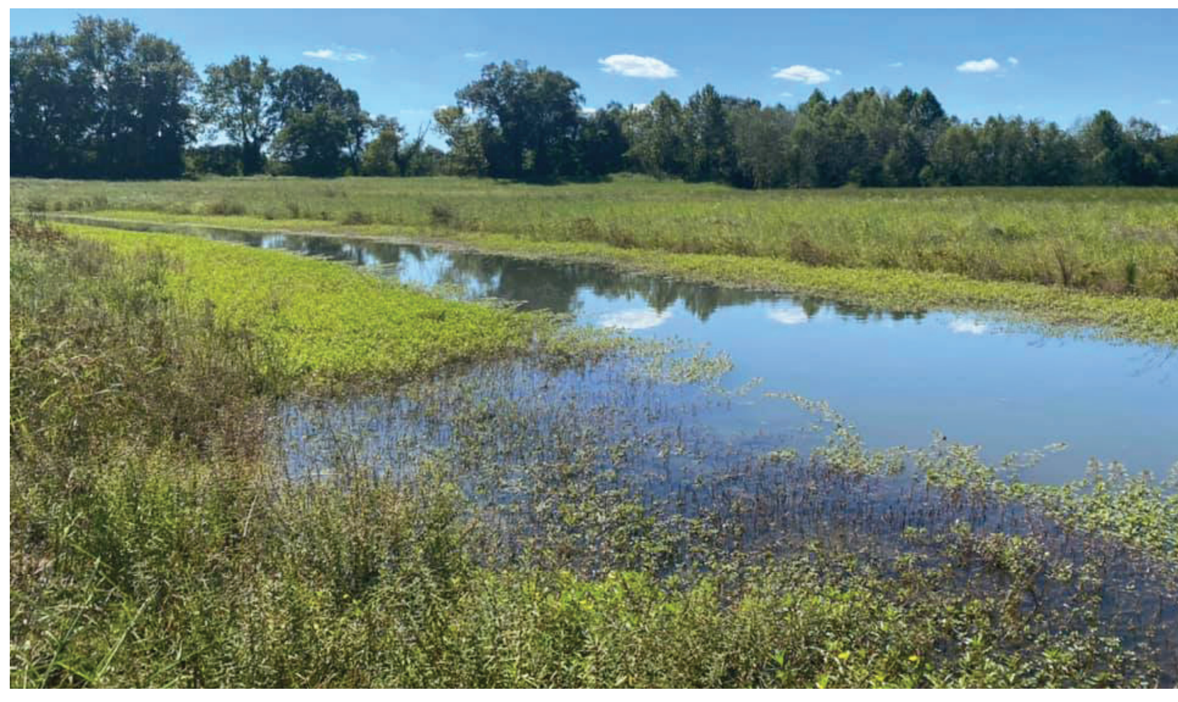
Located between Jackson and Three Way, the new Middle Fork Bottoms Recreation Area will not only provide access for fishing, kayaking, canoeing, and dog training but also work as a major flood mitigation project for surrounding communities.

Within these habitats, the recreation area will protect two nationally endangered species – the whorled sunflower and Indiana bat – along with several threatened species including the northern long-eared bat, Lamance iris, blue sucker, red starvine, and lake-bank sedge. The land is also home to a grove of pawpaws – the largest edible fruit tree native to North America – that officials are