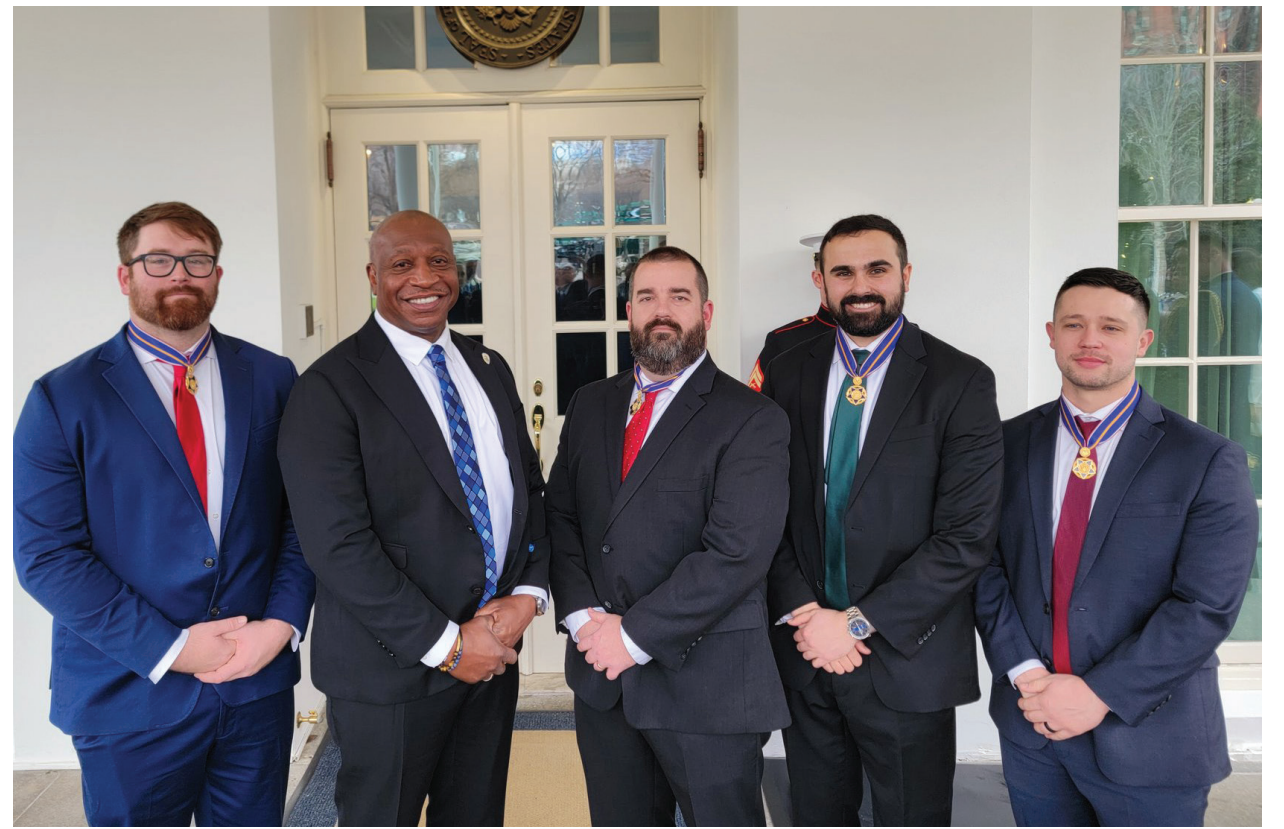
Five Metro Nashville Police Officers involved in ending the Covenant School shooting have been awarded the Public Safety Officer Medal of Valor, the highest national award for valor by a public safety officer.