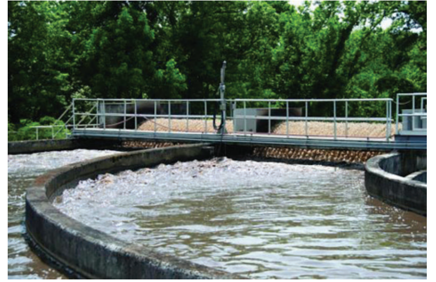
Fayetteville's water treatment plant.

received $650,000 in loans. Of those funds, $500,000 come from the Clean Water State Revolving Fund Loan Program for collection system rehabilitation. The loan has a five-year term at 2.38% interest. White Pine received $250,000 in principal forgiveness with the remainder of the loan amount to be paid back as principal.