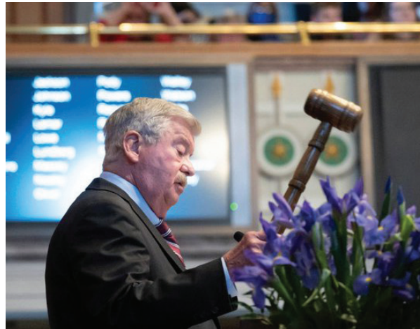
Lt. Gov. Randy McNally gaveling in the Senate of the 114th General Assembly.