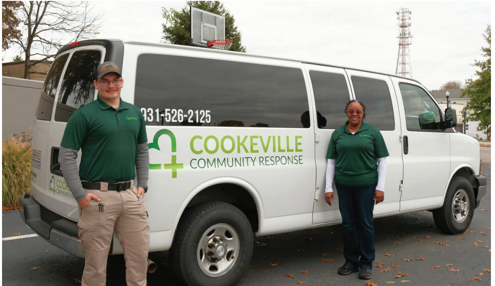
The Cookeville Community Response (CCR) team provides crisis intervention in situations where law enforcement isn’t needed, freeing up time and energy for law enforcement to focus on other calls. The service works on situations such as crisis counseling for suicide and grief, connecting residents to emergency housing and resources, and working to provide a safety net to prevent repeat calls to emergency services.

The program offers safe, effective interactions with Cookeville residents experiencing mental health crises through a collaborative response. In the case of a crisis, callers are advised to contact the