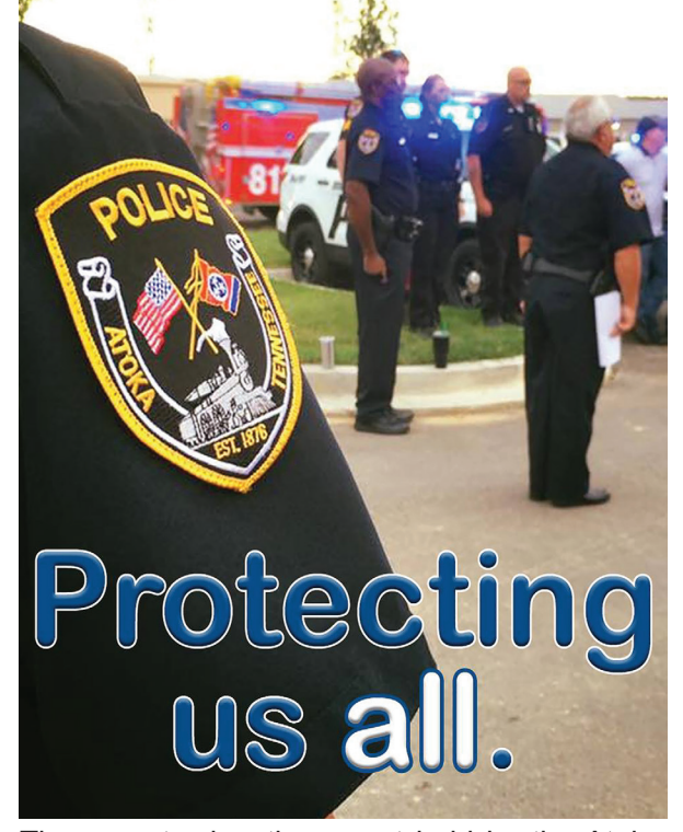
The recent education event held by the Atoka Police Department is part of new community-oriented policing efforts by the department.