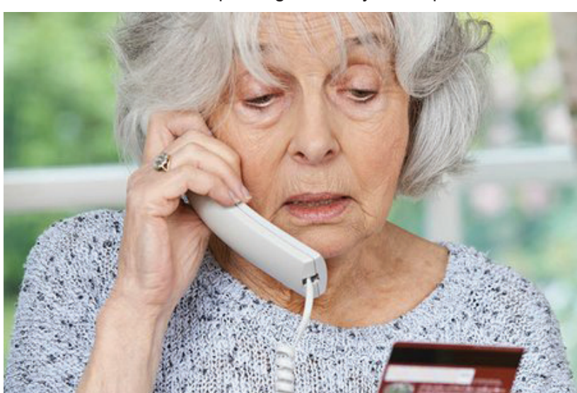
After noticing a 14% increase in fraud reports in their community, the Atoka Police Department conducted an informational meeting discussing fraud, cybercrime, and other issues. Reports of phone and internet fraud have increased in the passed year with seniors being a major group targeted by scammers.

you always answered it," he said. "After 50 years of always answering that phone, it's hard to change that behavior. That paradigm shift