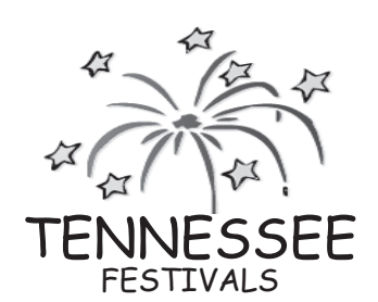
July 23-24: Franklin Bluegrass Along the Harpeth Fiddlers Jamboree

State and local governments spend more money than the federal government to build and maintain much of the public infrastructure that Americans rely on day to day, particularly transportation and waterworks. But new infrastructure legislation has the potential to significantly boost the amount of federal dollars going to the state and local level to support spending on these kinds of public works projects.