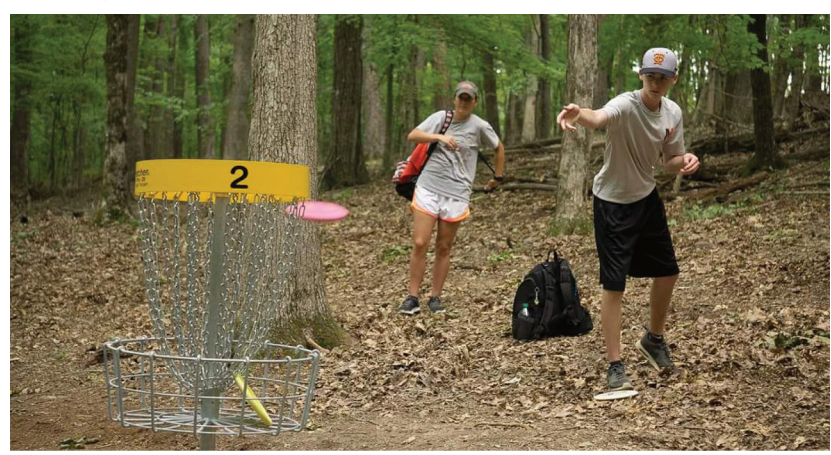
Morristown is home to five unique disc golf courses and has gained a reputation as the Disc Golf Capital of Tennessee. The city recently hosted the state disc golf tournament and is home to numerous disc golf events. A sport that is catching on with players of all ages, disc golf courses are relatively easy to construct and maintain for cities, providing hours of recreation to players at a lower cost to taxpayers and municipalities than many other types of recreation facility.

ments who have disc golf courses have introductory skill training days and give people a chance to try their hand at it."