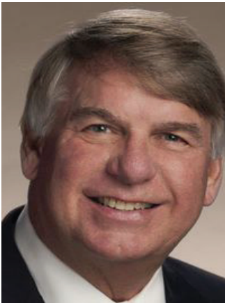
State Sen. Ed Jackson, R-Jackson, Ad Hoc Committee Co-chair

D-Memphis, agreed there the state needed to overhaul how they state approaches rehabilitation with recent numbers indicating 40% of offenders released from state prisons go on to reoffend. Parkinson suggested holding TDOC accountable for recidivism as well as ensuring the mental health care provided to inmates doesn’t stop once they leave the system.