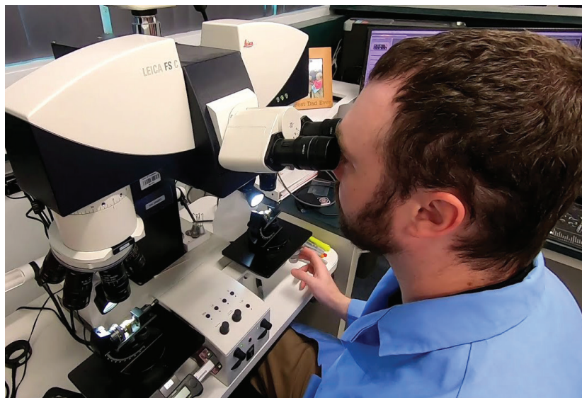
Additional funding to provide more forensic scientists at labs across the state is just one of the ways lawmakers are looking to reform criminal justice in the state.