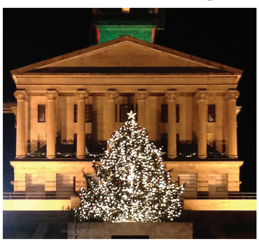
BY KATE COIL