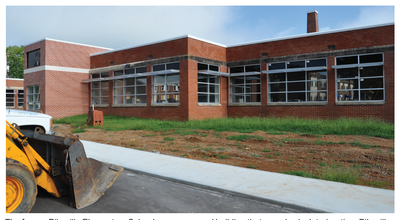
The former Pikeville Elementary School was an unused building that was slowly deteriorating. Pikeville recognized the former elementary school's potential as becoming a way to consolidate most of the cities departments into one building.

Once the heating and cooling system was upgraded, the building still needs to be able to keep as much of the conditioned air inside