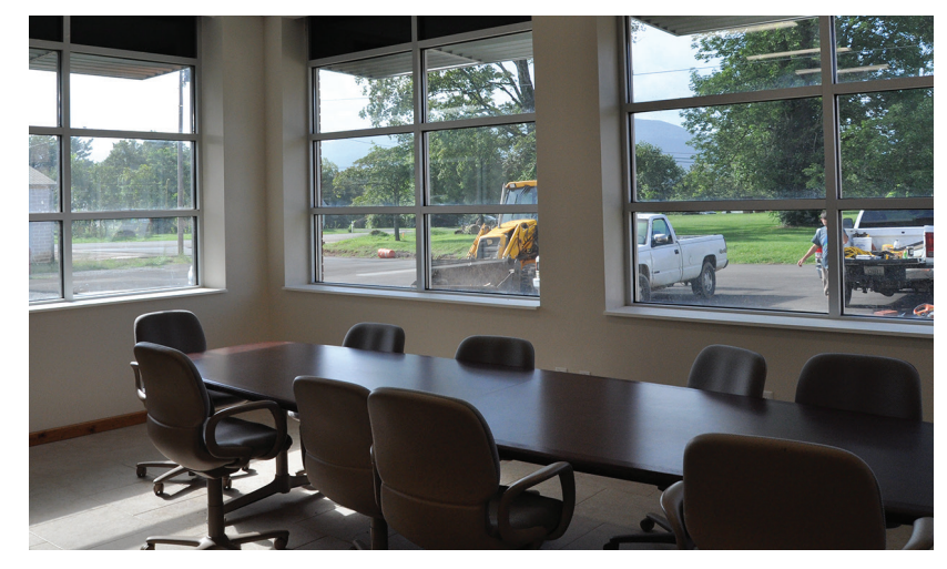
Former classrooms now serve as offices and meeting rooms for Pikeville's city staff at the renovated municipal complex.

A community kitchen, workforce development training space, and central location for municipal matters makes a great central point for the community. The city was