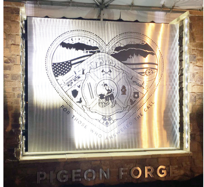
Pigeon Forge recently unveiled this memorial to first responders at the town's Patriot Park following a luncheon to honor the more than 200 first responders who came to fight the wildfires.

of the rebuilding process for the past six months with 300 structures currently being worked on within the city limits of Gatlinburg and another 300 in Sevier County.