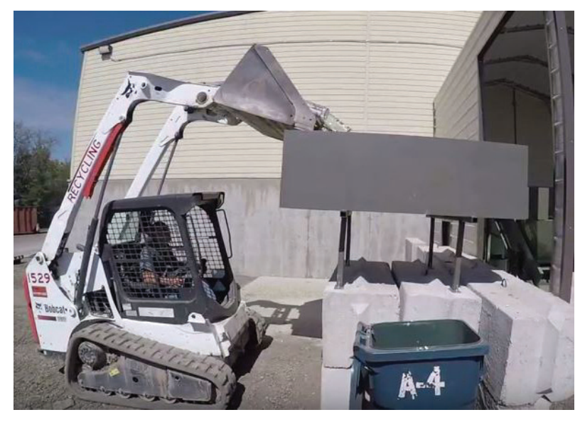
Above: Gallatin public works employees use a loader to dump recycled glass into a hopper, which then feeds the glass into the pulverizer. Left: After the glass is processed, it comes out in eight-of-an-inch or smaller pieces that can be held in bare hands without causing cuts.

"There are certain things you don't want to process, like glass that has candle wax in it," he said. "Those don't do well in it. There are certain size objects you don't want to stick in the crusher because they clog things up. We mainly accept glass bottles, food jars, and those sort of things."