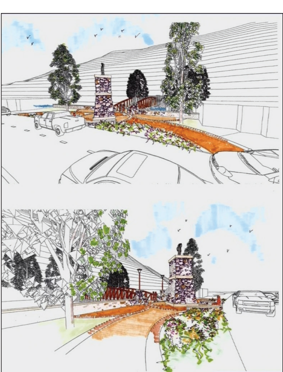
The city of Gatlinburg recently unveiled plans for a memorial to both first responders and fire victims to be located on the city's parkway.

"Things could have been a lot worse for us," she said. "We didn't lose any businesses, but we lost an entire subdivision of 19 structures.