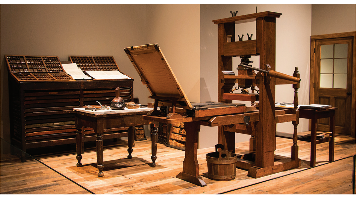
The pioneer newspaper press exhibition in the museum is based on one of the early presses operated by the Knoxville Gazette , the first newspaper published in the state and only the third newspaper published west of the Appalachian Mountains.

To learn more about the museum, visit <a href="https://tnmuseum.org">https://tnmuseum.org</a>.