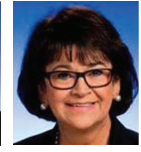
Sen. Dolores Gresham, Republican Caucus Secretary