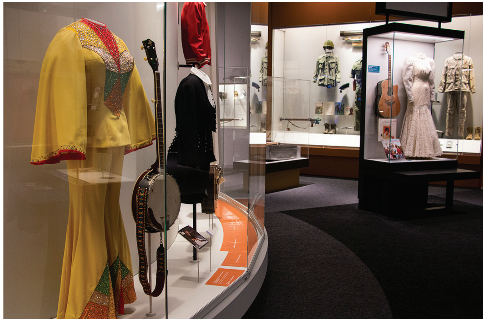
Clothing ranging from outfits worn on "The Grand Ole Opry" to the uniforms of Tennessee soldiers in various conflicts to antebellum dresses to a fiber moccasion show how times — and fashions — have changed in Tennessee.

"There is only so much you can tell with an artifact and a text label with 60 to 100 words," Pagetta said. "Being able to present films, and interactive displays, and large graphic panels, enables us to tell more stories and to tell them more deeply. Plus the Expansion of Change and Challenge and Tennessee Transforms allow us to tell a fuller story. We can all agree that