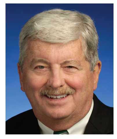
Sen. Randy McNally Lt. Gov. and Senate Speaker

Sen. Ferrell Haile, R-Gallatin, was nominated to serve as speaker pro tempore and Republican caucus treasurer. Haile was elected in 2010 to represent Senate District 19, serving until 2011 and then was re-elected again in 2013.